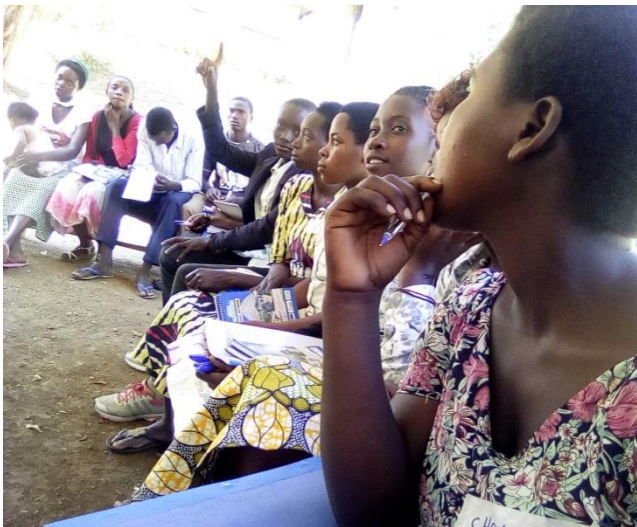
"Huguka Dukore Youth in WRN! and BYOB Trainings in Nyanza, (Photo: ©AVSI Rwanda, August 2017)