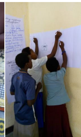
"Huguka Dukore Single Mothers in Hospitality and Modern Basket Making in Ruhango District (September 2017)